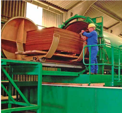
Castleford Treatment Centre