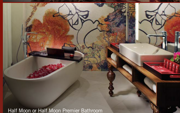
Half Moon or Half Moon Premier Bathroom