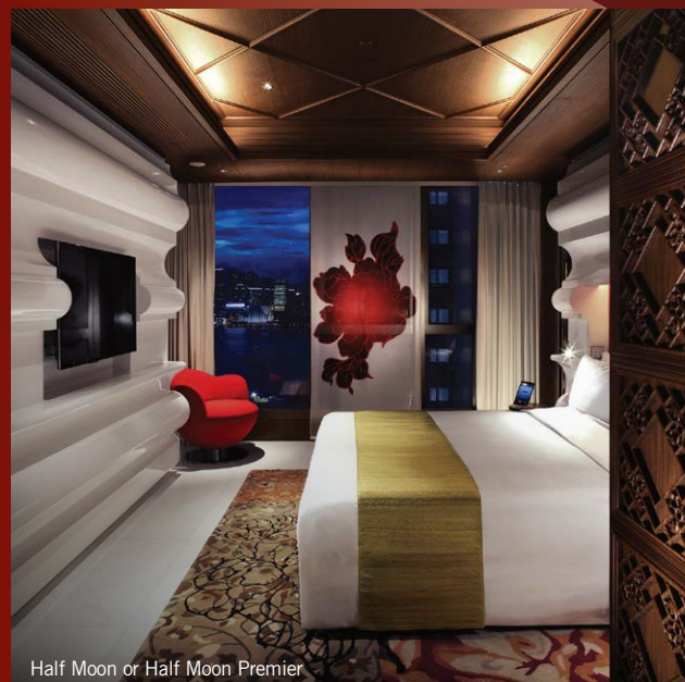
Half Moon or Half Moon Premier

Inspiration for the interior was also taken from traditional Chinese craftsmanship. Ceramics, carved timber and cut crystal are used throughout, creating a cultural mix which is made relevant today with a warm color palette of black, white, dark brown, red and gold.