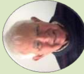
Sodor Partners Trustee