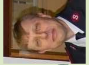
Douglas Churches Town Centre Partnership Chair